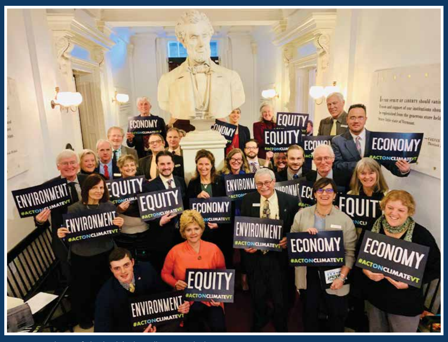
Some members of the legislative Climate Solutions Caucus.

The organizations signed onto these climate action priorities look forward to working with policy makers and all Vermonters to tackle climate change in a way that grows jobs, protects the most vulnerable, enhances public health and safeguards our natural resources.