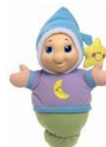
Hasbro's Gloworm: Testing Found Three Phthalates